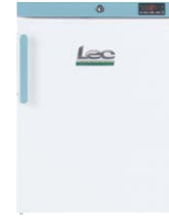
Countertop Ward Refrigerator Solid Door 82L